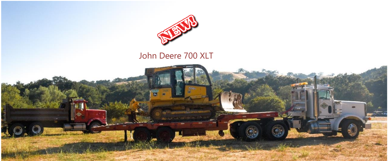
John Deere 700 XLT